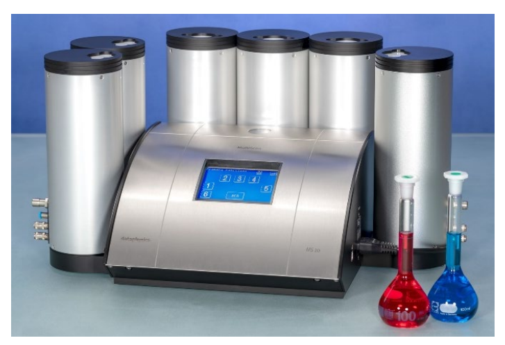
Fig. 2: DataPhysics Instruments stability analysis system MultiScan MS 20 with six independent ScanTower.

With its matching software MSC, the MS 20 is an ideal partner for the stability analysis since even the slightest changes within dispersions can be detected and evaluated. The MS 20 enables a fast and objective analysis of the dispersion stability as well as conclusions on possible destabilisation mechanisms .