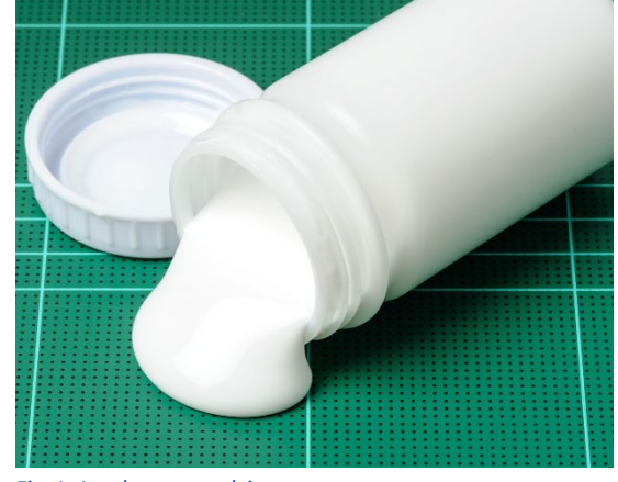
Fig. 1: A polymer emulsion.

Polymer emulsions have been widely applied in different areas as adhesives, binders, coatings, dipped goods, foam products etc, due to their unique properties. A Polymer emulsion is a colloidal dispersion of polymer molecules in an aqueous system. The dispersion stability of a polymer emulsion has a significant impact on its processing, transportation and storage. Among other factors, temperature has a great influence on the dispersion stability. Hence, knowledge of the temperature dependent stability of polymer emulsions is of great interest in oder to modify and improve the formulation for a better processability and performance. As latex is one of the most common and important polymer emulsions, a stability study of two commercially available latex emulsions at different temperatures will be presented throughout this application note.