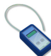
GF 1010 with Silicone Cover